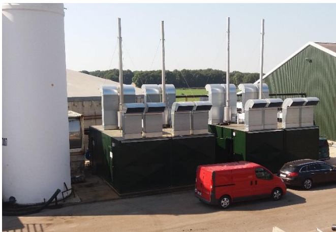
Production of electricity CHP unit with 4 CHP's