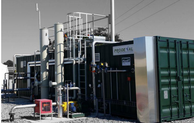
Production of natural gas Including gasupgrading